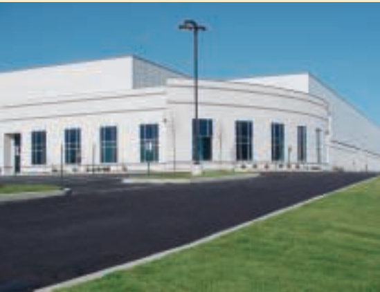
MAC Direct took occupancy of their new 258,000 square foot state-of-the-art distribution facility at Centerpoint Business Complex