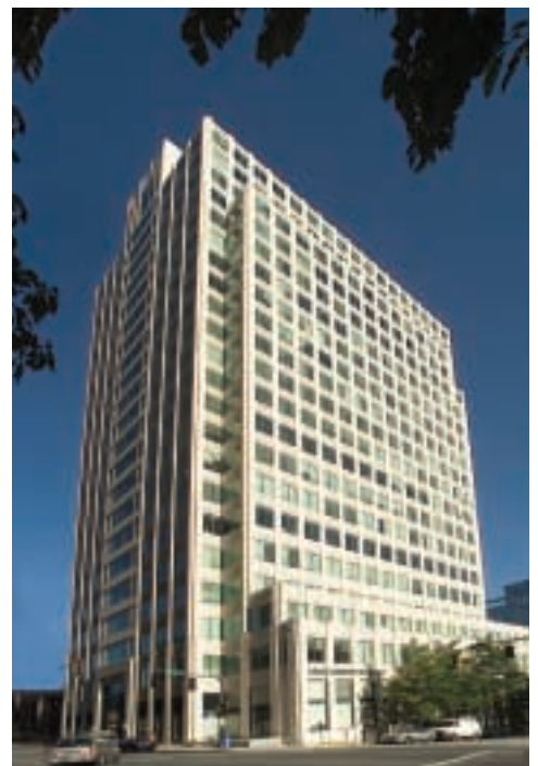
The Chase Manhattan Centre, Wilmington's premier 23-story landmark office building

Now responsible for building management as well as for leasing, McConnell Johnson plans additional improvements to continue to stay ahead of the business needs of existing and future tenants. ❖